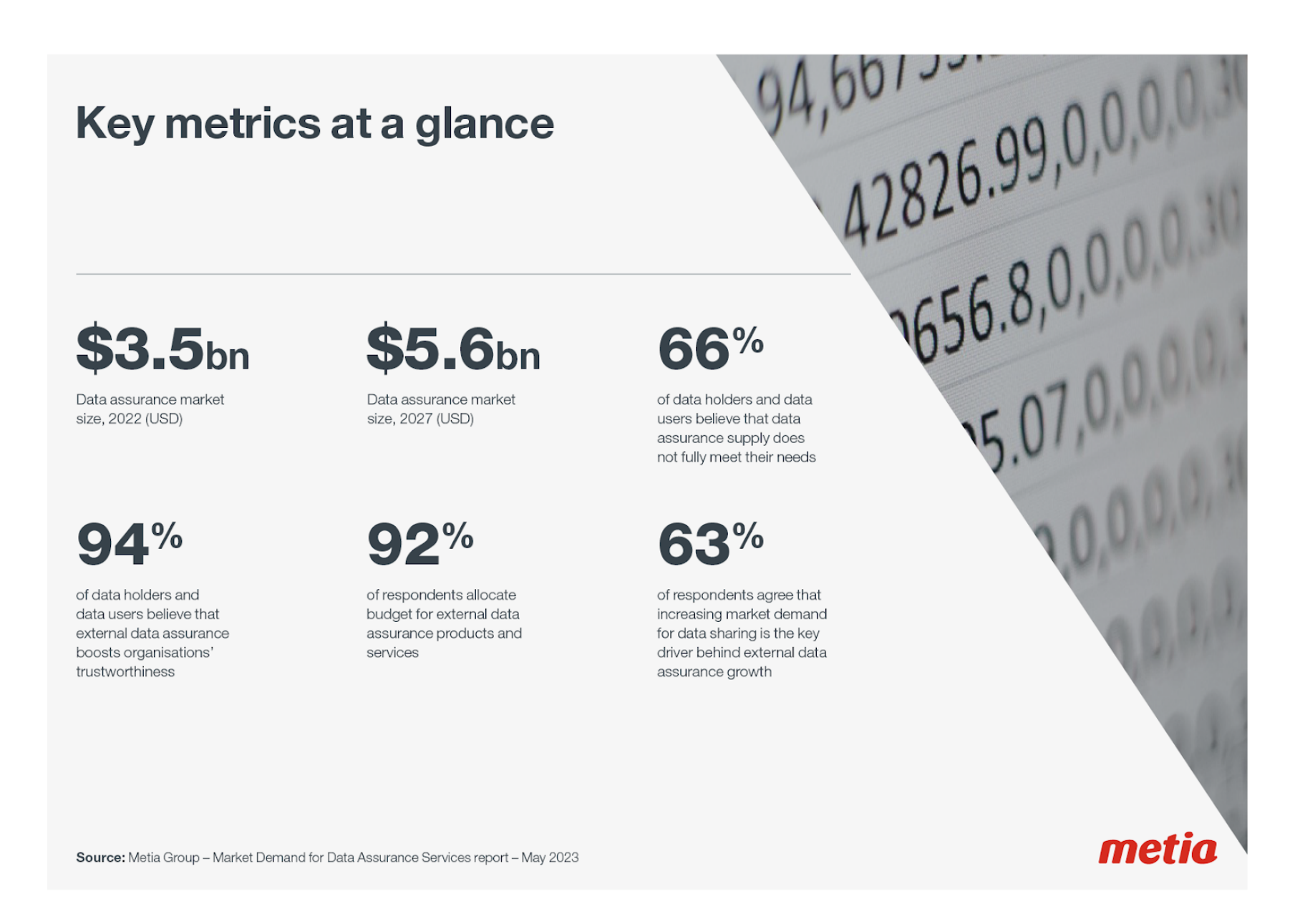
Figure 1. Data assurance market key metrics