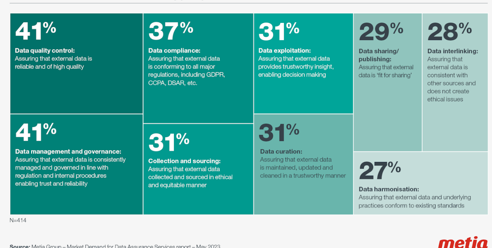
Figure 3. Main challenges faced by data holders

Data holders' attitudes towards the key pain points of external data assurance