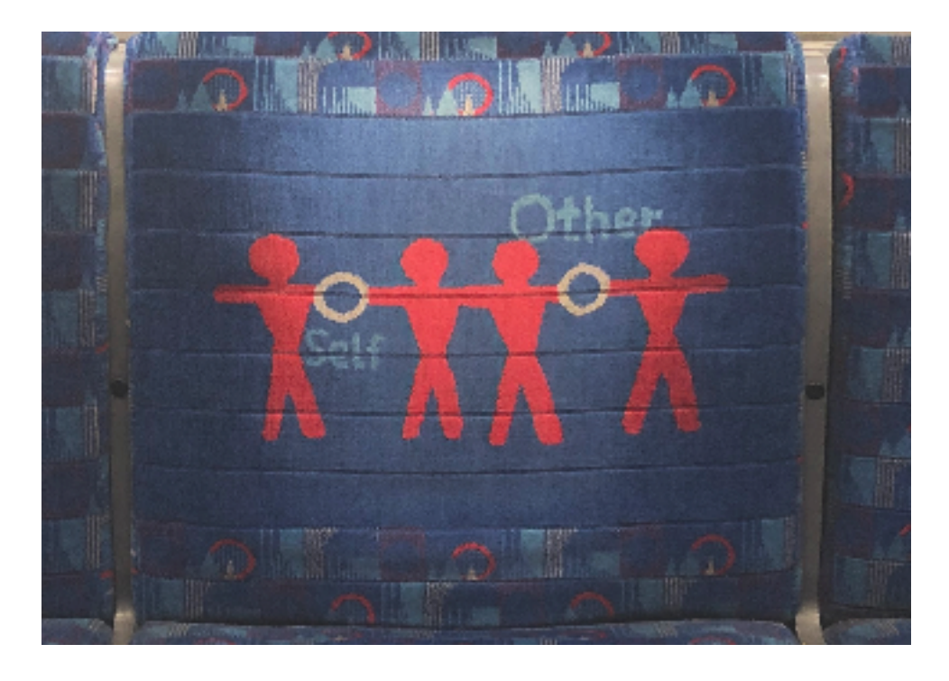
Figure 2. A seat on the Central Line, Transport for London

To address these issues and risks, businesses are encouraged to think more holistically about engagement, exploring ways to explain their business models, how data about people is collected, used and stored, and the benefits and trade-offs involved in clear and relevant ways. People can understand the fundamentals of how a system works when given the relevant information (systems thinker Donella Meadows used the example of a <u>bathtub</u> to show this<sup>43</sup>). This sort of communication can help users make informed choices, either as individuals, or with the support of third parties like <u>data representatives</u><sup>44</sup>.